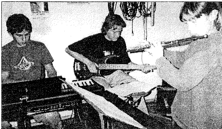
SCHOOL OF MUSIC